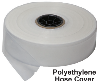
Polyethylene Hose Cover

All hose length can be custom ordered or include other fitting types for an additional charge.